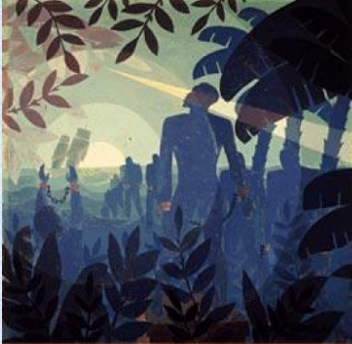
Into Bondage (1936)