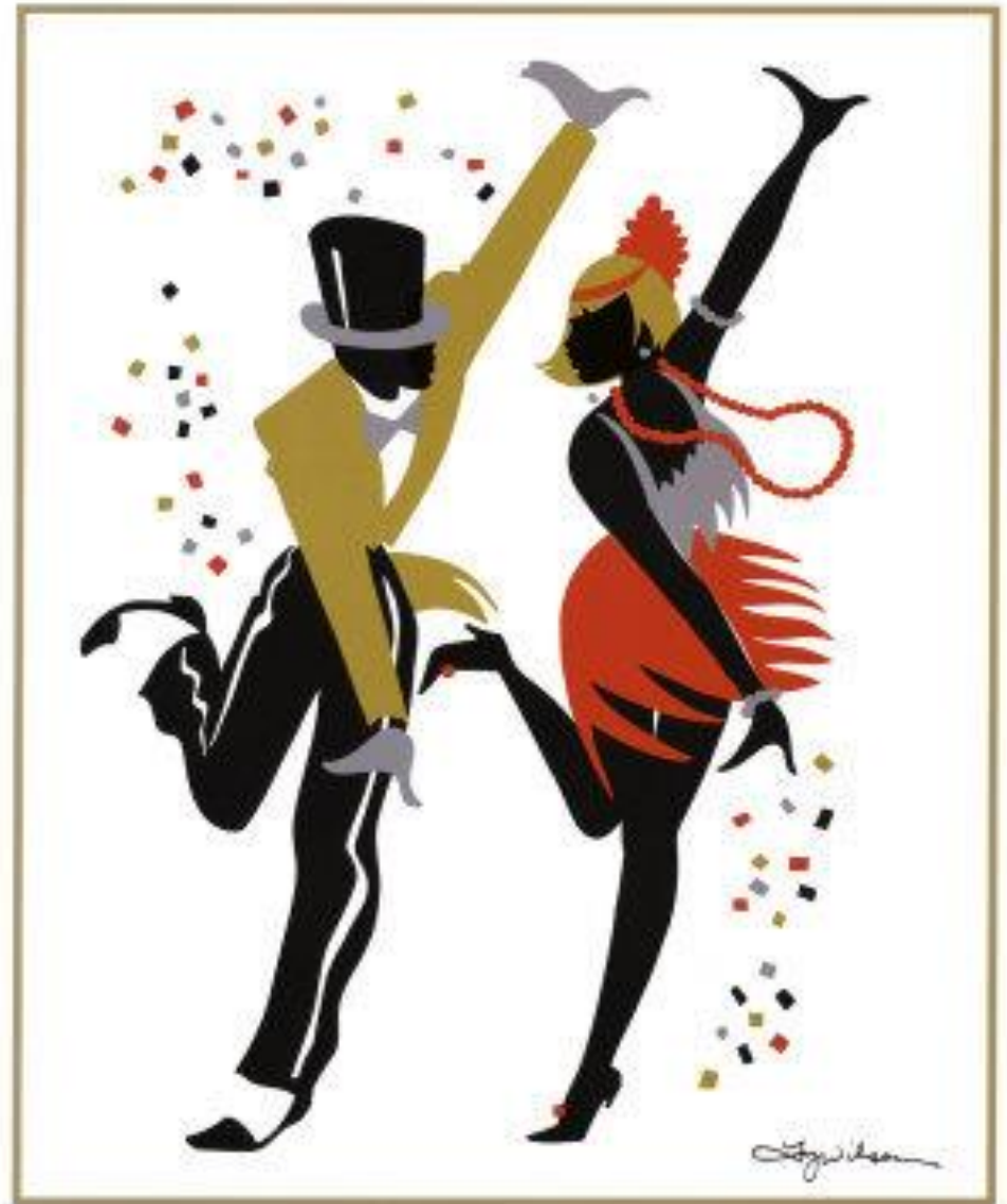
The Charleston