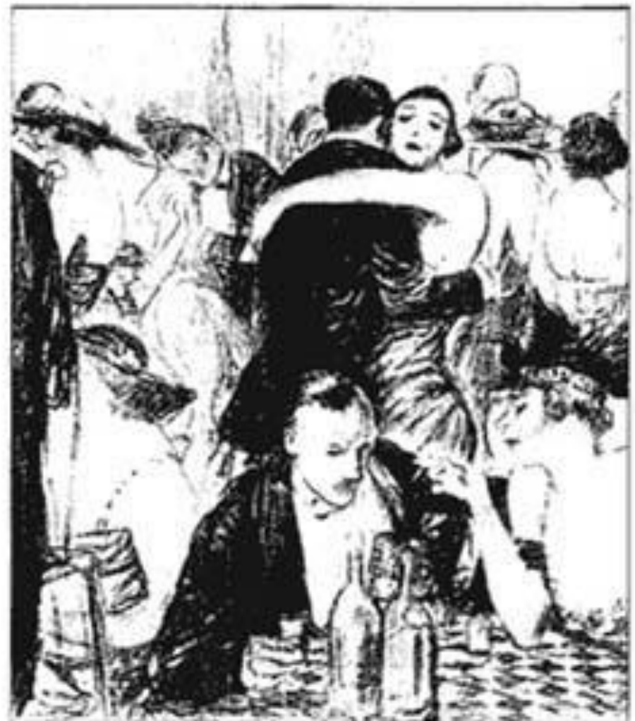
One Artist's Idea of What Has Happened to Society. Printed in Literary Digest , 1921.