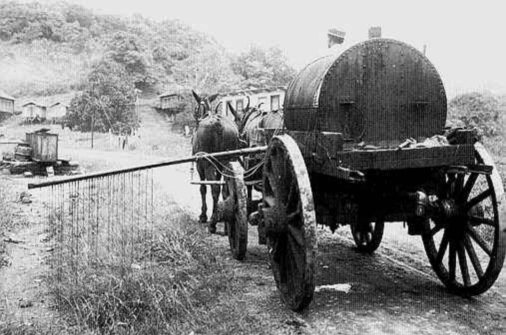
1905 fumigation car eradicating the mosquitoes - Panama City