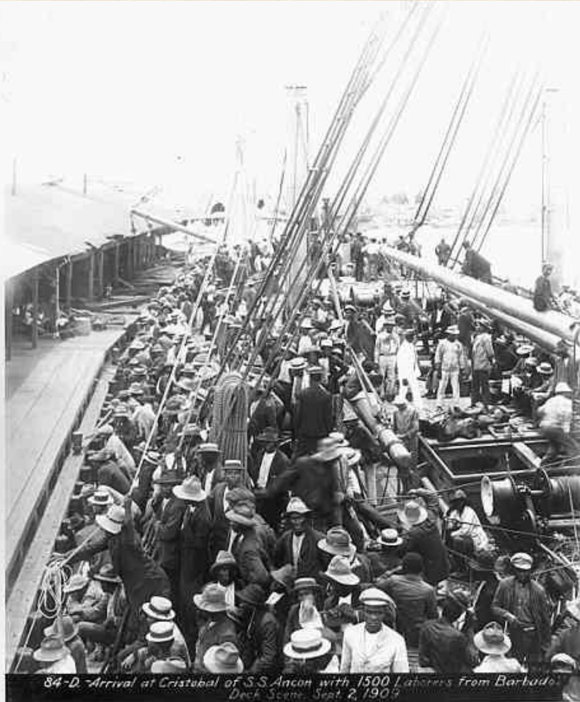
84-D. Arrival at Cristobal of S.S. Ancon with 1500 Laborers from Barbadoe. Deck Scene, Sept. 2, 1909

1909 Arrival of SS. Ancon with 1500 laborers from Barbados at the Cristobal Port in Colon, Panama