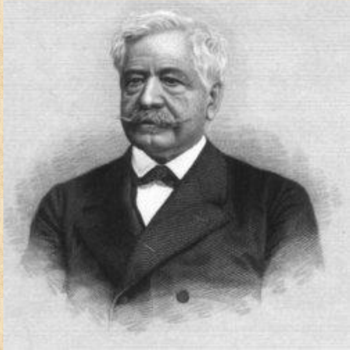
Ferdinand de Lesseps